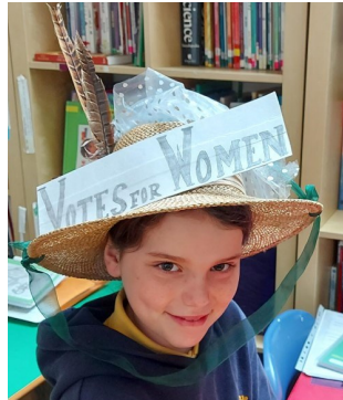
Poppy's Emmeline Pankhurst