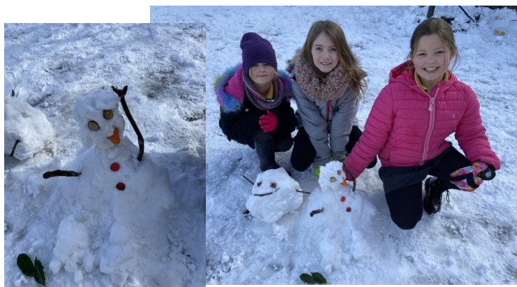
Fun in the snow!