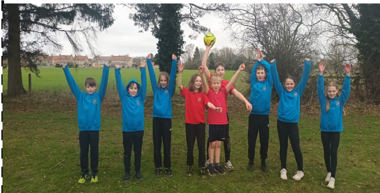
Y5/6 netball team