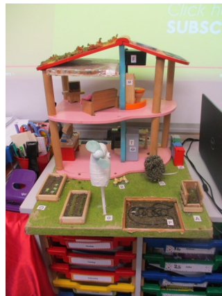
Y3/4 Workshops with Powerdown Pete.