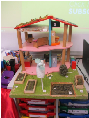
Y3/4 Workshops with Powerdown Pete.